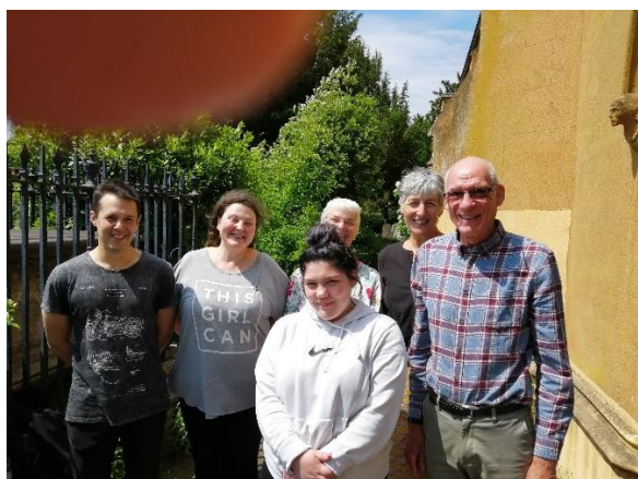
Quarter peal band