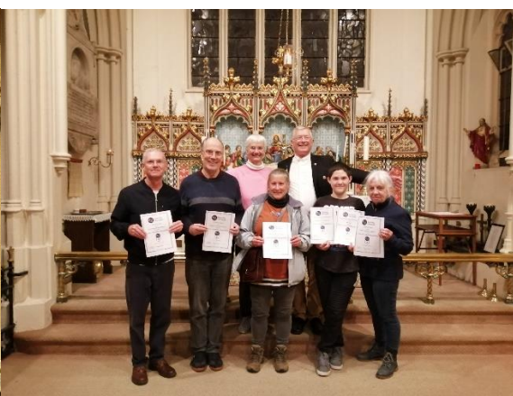
Mitcham ringers receiving ART certificates