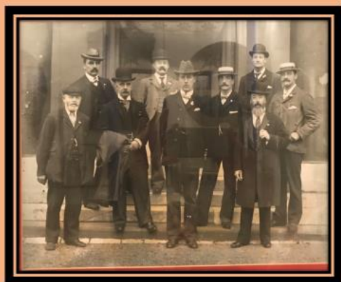
Battersea August 9 th 1922

In January of 2023 we hosted Bellringer's Sunday, a feature now being taken up by the Central Council! We had a great response from the congregation, and hoped to put bellringing in the minds of all those who attend the church.