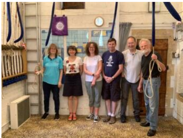
Queen's Platinum Jubilee quarter peal band

Over many years in our belfry, we have suffered from stiff ropes due to the weather – but not any more! We now leave the ropes untied in a large bag containing socks full of clean cat litter before tying the bag and hoisting it up on the spider. It works like magic!