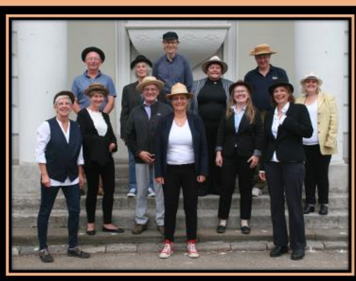
Battersea August 9 th 2022