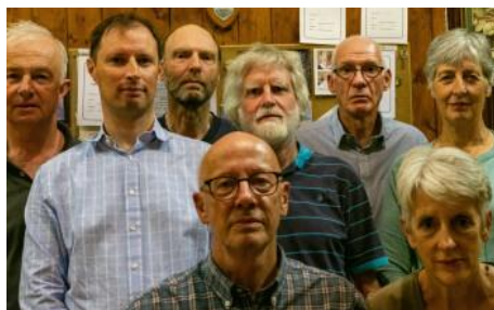
Band for fully muffled quarter peal of Stedman and Grandsire Triples on 14 September for Her Majesty the Queen