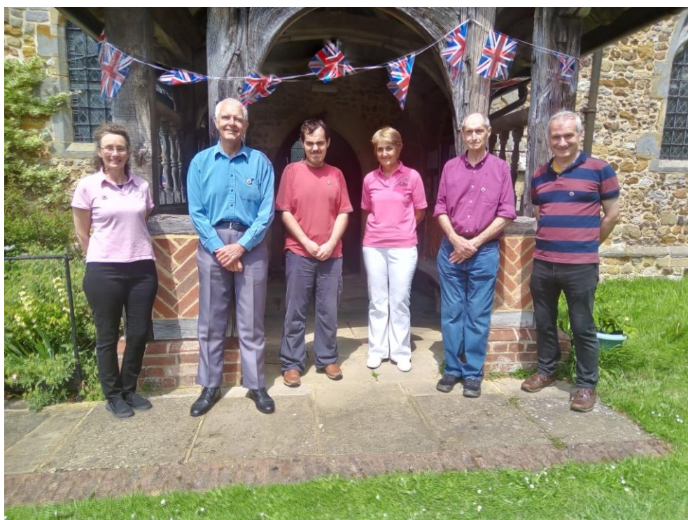
Ockley Jubilee quarter band

We were very saddened by the death of the Queen but had been prepared for the event, renovating some old muffles which enabled us to ring fully muffled with the tenor open at backstroke for the Queen's funeral in September as well as ringing a quarter peal in memorium. We were honoured to be able to ring in this way, not having experienced it before.