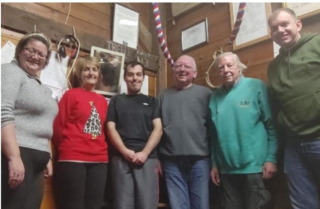
Capel band with their two first quarter peelers