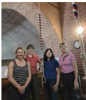
Platinum Jubilee celebrations from Outwood ringers and guests

We have only 2 regular ringers at Outwood at present, but have a couple of new ringers learning with the help of Bletchingley ringers. Our hope is to have Sunday ringing and more regular practice nights in the future.