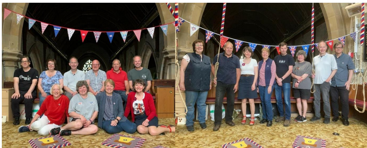
Queen's Platinum Jubilee celebration bands