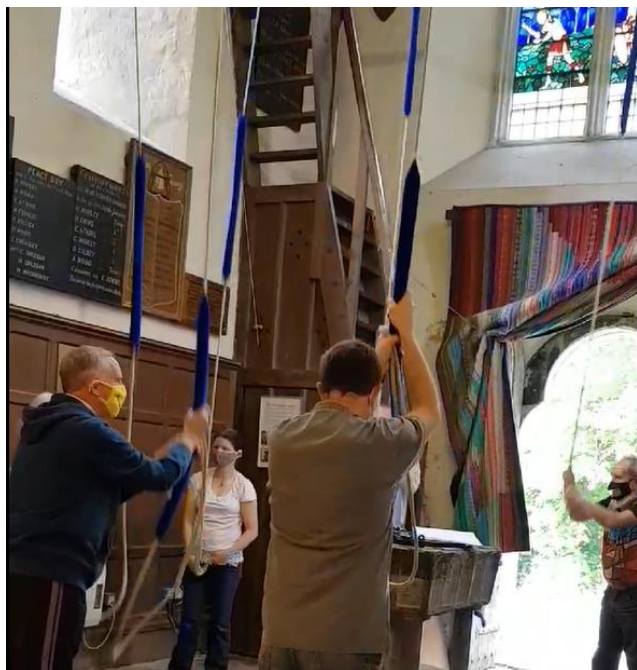
Back to Sunday service ringing in May 2021 wearing masks and the west door open for fresh air

Merstham is emerging from the ravages of Covid with enthusiasm and we are back up to numbers seen before the Pandemic. Skills are another matter - we'll all rather rusty but determined to rebuild our repertoire. We've restarted recruiting - two new learners and hoping to rope in some more. Hot drinks too (and sometimes cakes) on practice night to ward away any suggestions that Merstham is a cold tower. We are hoping the coming year will see the return of visiting/being visited so we can pick up new skills and share our enjoyment.