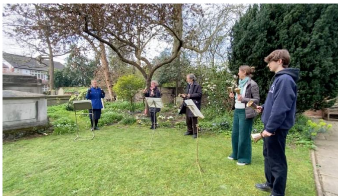
Barnes band ringing handbells in the churchyard at Easter 2021

The handbells came out again in December to ring carols in the churchyard for the Barnes Christmas Festival but a week later, the Omicron variant meant we were back down to ringing just four bells again, spaced out and in masks - what a year!