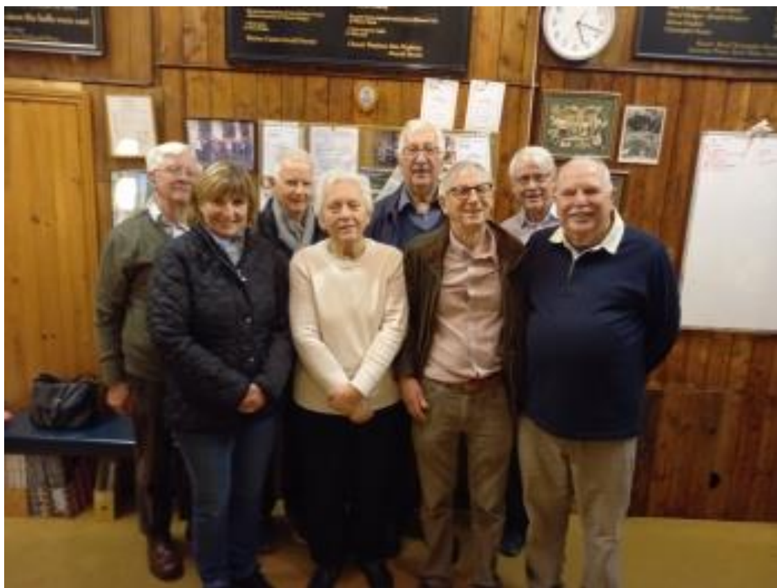
The band anti-clockwise from front right