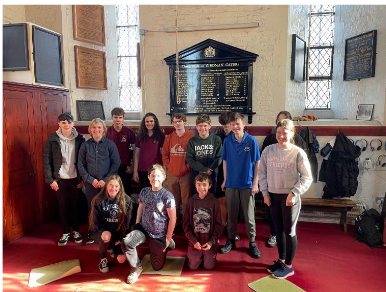
Outing to London