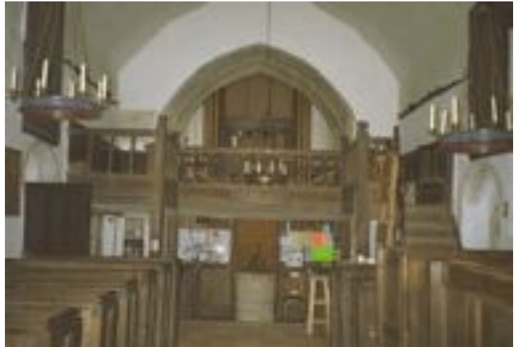
Dorney church

Continuing the District's unofficial tour of Olympic 2012 venues, the morning started at St James the Less, Dorney - within site of the entrance to Dorney lakes where the British team will hope to win several golds in the rowing events.