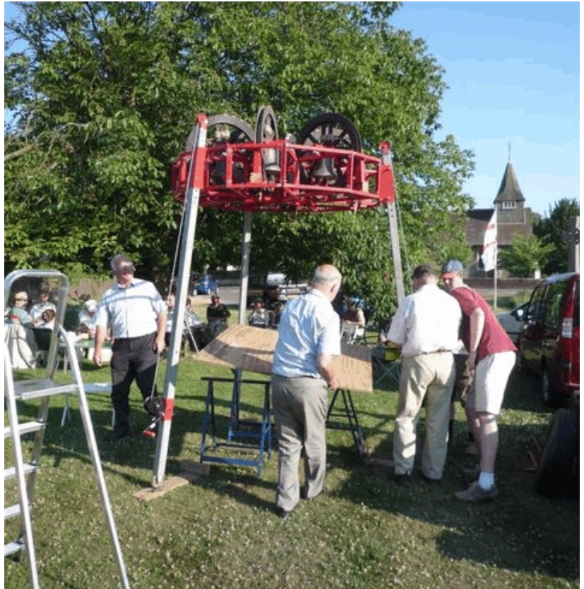
Trafford Mini-ring being set up